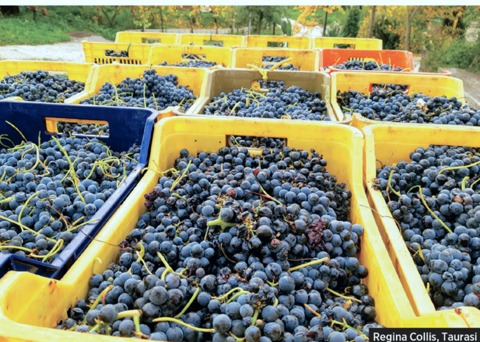
Regina Collis, Taurasi